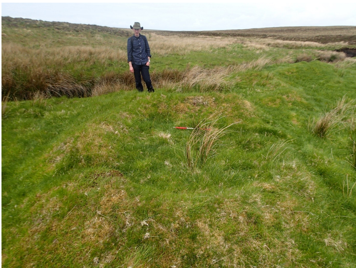
Figure 7: what seemed to be a rectilinear shieling but constructed of turf with no stone, at NB 45595 47067