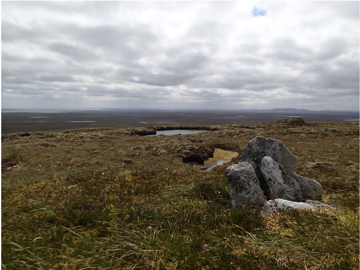
Figure 9: Tom Fionnlaigh – a small cairn on the south peak of Muirneag