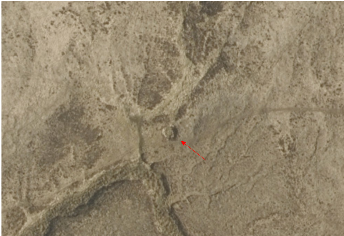
Figure 12: Circular shape in the moor at the eastern foot of Muirneag.

A final point of interest – and mystery – was an almost perfectly circular shape at the eastern foot of Muirneag, spotted on the aerial imagery – see Figure 11, below.