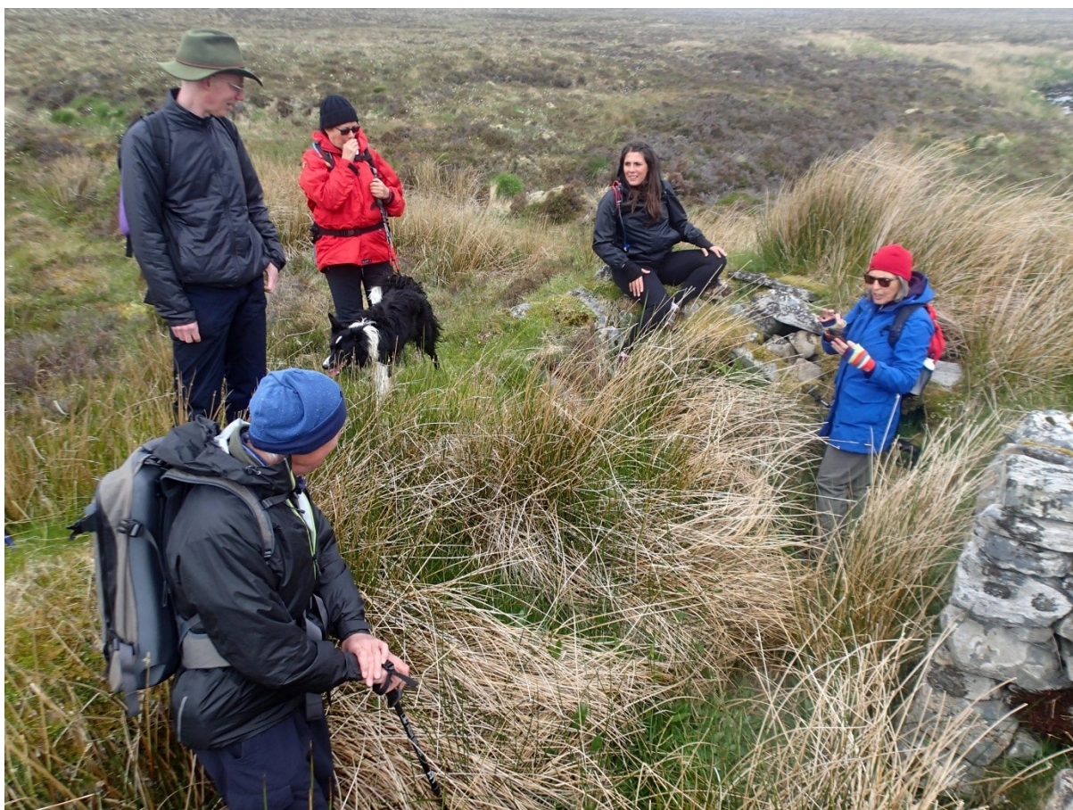
Figure 2: One of the latest type of Shieling (truly rectangular) close to the end of the peat road, at NB 46092 44468