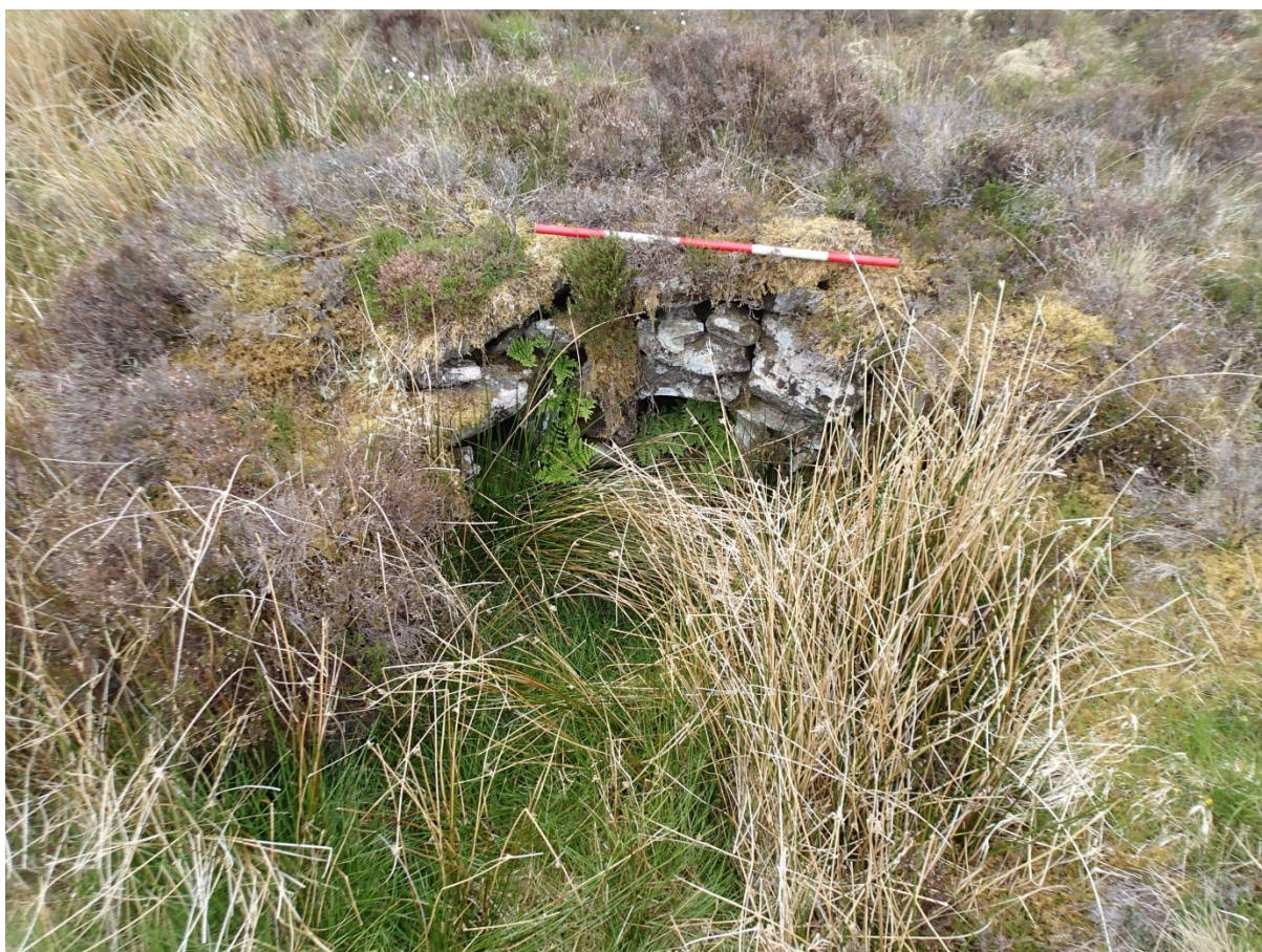
Figure 3: An example of a “Curvilinear” shieling on the Gress river