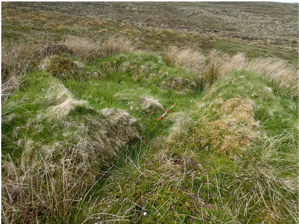
Figure 11: The best preserved example of Airigh at Bot na Gille, NB 48485 48988.