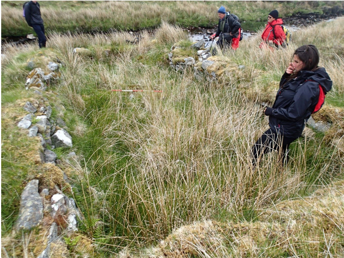
Figure 4: A “Taigh Earraich”, or Spring house. These small houses are part way between a Blackhouse and a Shieling. They came into use fairly recently as an adaptation to years in which there was poor grazing in the villages and people brought their livestock out to the moor earlier than usual. NB 45926 44946.