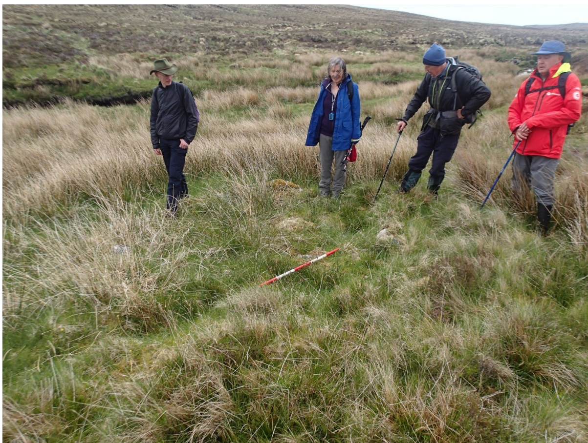
Figure 6: A possible “Both” or very early shieling. Its low wall footings were circular and very overgrown.