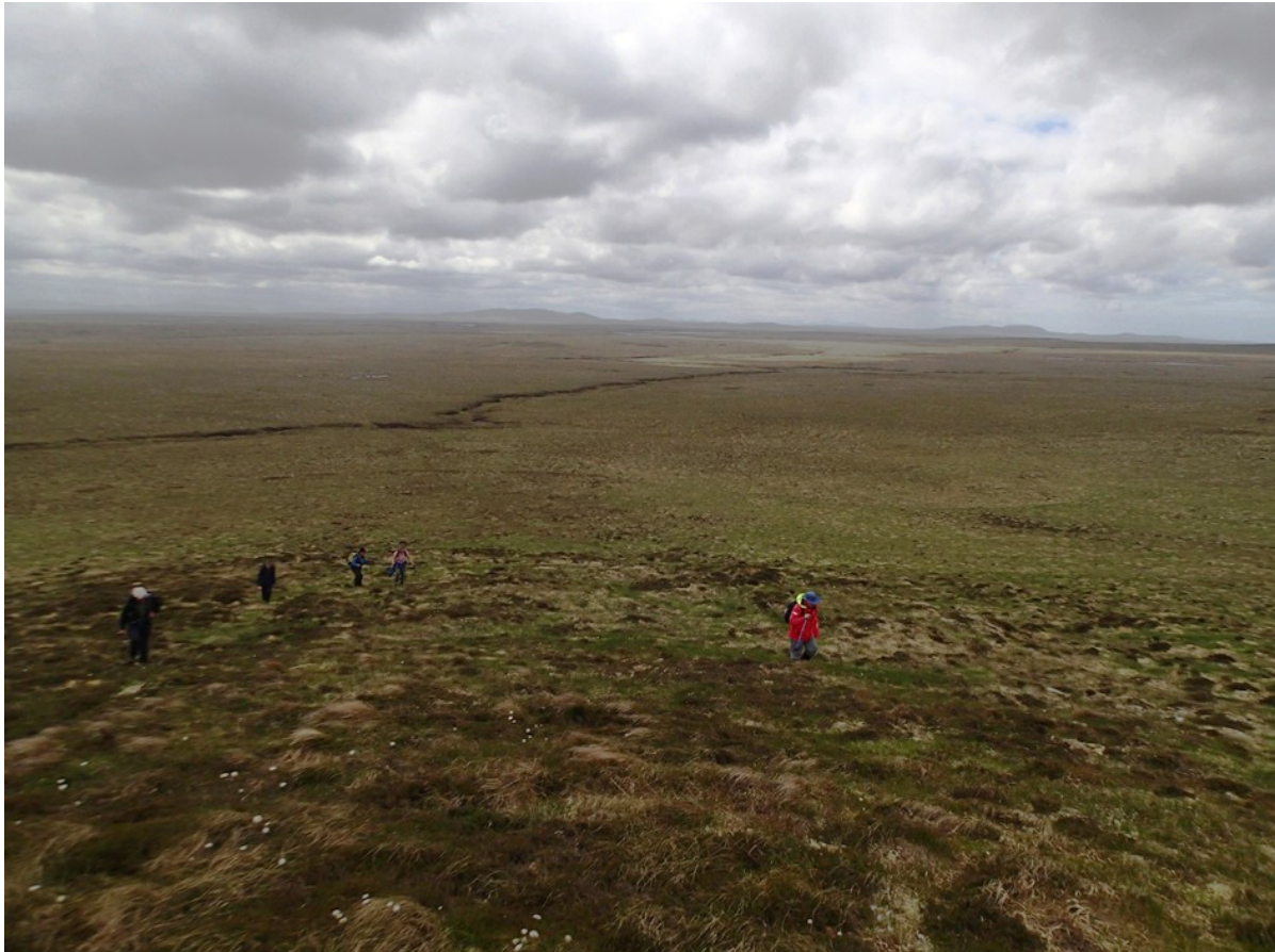
Figure 8: Starting the climb up Muirneag from Allt a'Deas Muirneag, Ben Barvas and Ben Bragar in the far distance.

Conditions underfoot became steadily more difficult, particularly once we left the Gress river bank. At the foot of Muirneag it got even harder, requiring us to wade through knee or even thigh deep moss and heather.