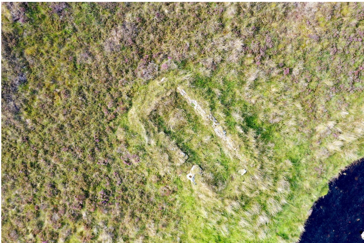
Figure 5: The same Taigh Earraich from above